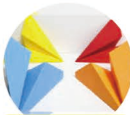
9/28 Airplane Origami