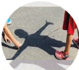
9/7 Body Portrait