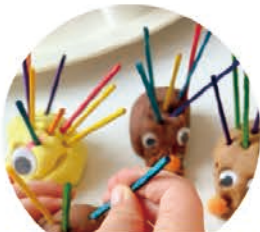
9/14 Clay Art